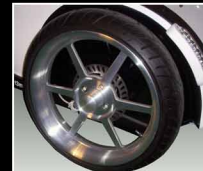
Hydraulic Disc Brakes