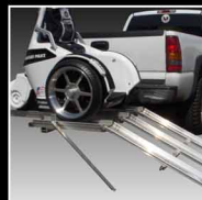
Hitch Mount Carrier