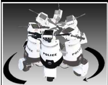
0-Degree Turning Radius