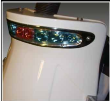
Integrated LED Lighting