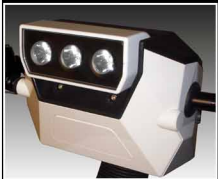
Adjustable LED Headlight