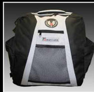
Black Pannier Bag

Siren Wail Tone + Yelp Horn Headlights LED Headlight/Spotlight 45-Degree Tilt Security Key On/Off Switch