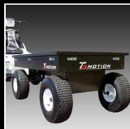
Multiple Trailer Options