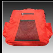
Red Pannier Bag