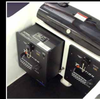
Swappable Power Modules