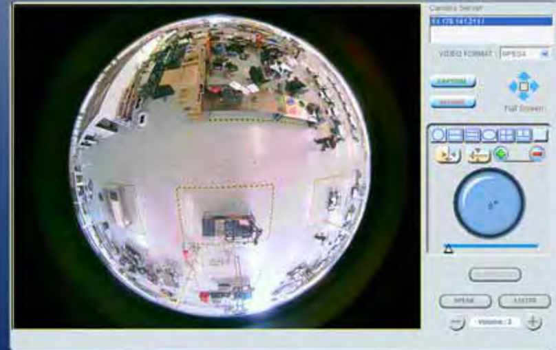
Desktop Viewing Images