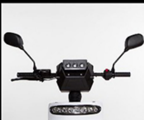
Rear View Mirror Kit Provides the operator increased visibility, boosting operator safety