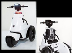
Warranty Options Available in 1 or 2 year extended warranties