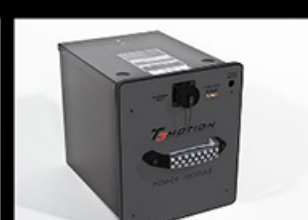
High Performance Battery Available in 25 or 45-mile range batteries