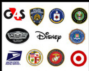
Customized Graphics Include customized graphics anywhere on vehicle