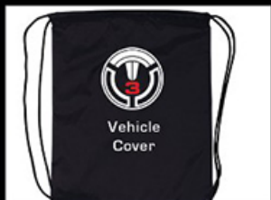
T3 Series Vehicle Cover Prevents dust build-up when not in operation