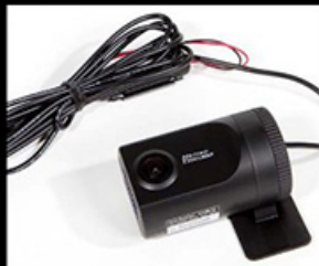
Motiontrak 300 System Mounts to any vehicle, monitoring and recording patrol movements