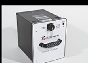
Extended Battery Range 45-mile range