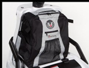
Pannier Pack Provides easily-accessible storage that can be removed quickly during emergencies