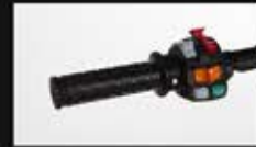
Intuitive Control System