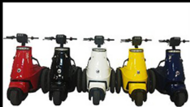
Various Color Options Customizable color options available