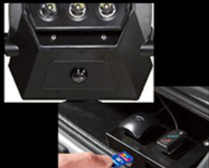
Motiontrak 330 System Covertly embedded into the T3 ESV headset to monitor and record surroundings and vehicle movements