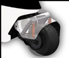
Front Wheel Suspension Amplifies operator comfort for long shifts or uneven roadways