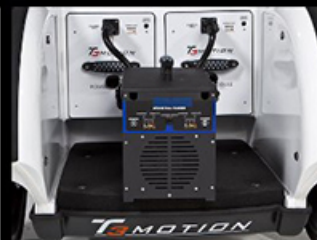
Battery Charger Efficiently charges both batteries simultaneously, either on or off the vehicle