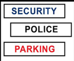
Decal Package Police and Security decals available in various color options