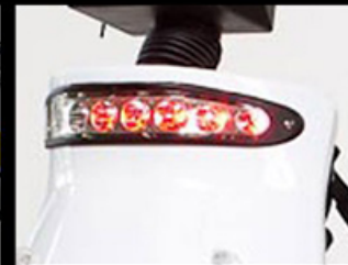
Warning Light Package Available in Red, Blue, Red/Blue, and Amber