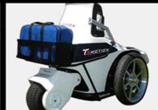
Front Storage "Grab Bag" Expands front storage capabilities during patrol