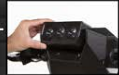
Adjustable LED Headlight