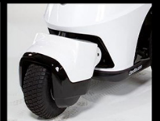
Gear Ratio Change Provides optimal torque for steep terrain and towing applications. 10:1, 12:1, 14:1, 18:1