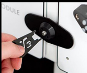
Keyed Nut for Battery Plate Anti-tampering device to lock the batteries in place, securing them tightly