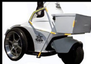
Front Storage Rack Expands front storage capabilities during patrol