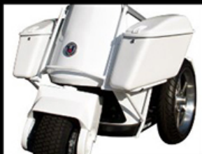
Side Storage Containers Expands side storage capabilities during patrol