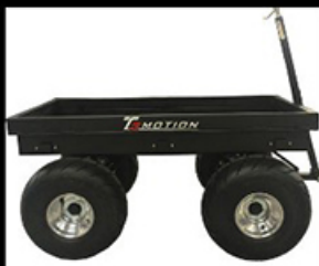
Trailer For extended cargo capacity up to 450 lbs