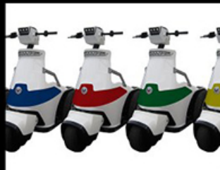
Vinyl Smile Graphic Wraps around T3 ESV for an eye-catching look. Various color options available