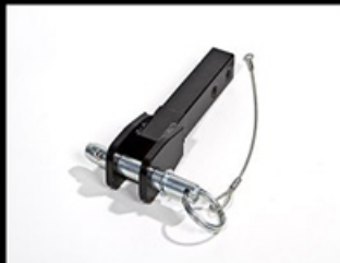
T3 Towing Hitch Mounts to T3 ESV for easy towing. Minimum 14:1 gear ratio required.