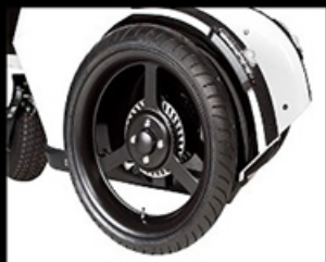
Alternative Tire Options Various terrain-specific tires available